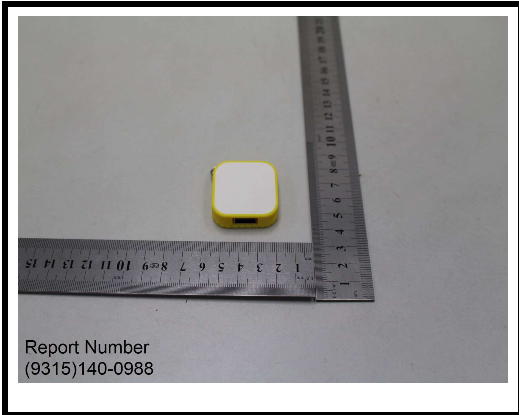
Photo of the Submitted Sample

LAB NO. : (9315)140-0988 DATE : Jun 03, 2015 PAGE : 3 OF 7